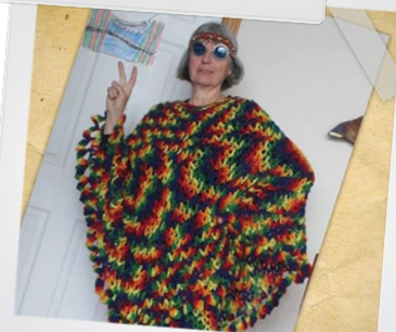
Viewers Choice Adult 2016