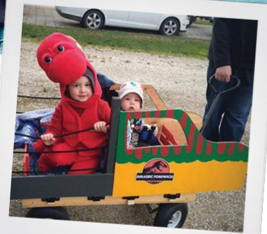
Most Creative Kids 2016

To enter, simply post a picture of yourself in the costume on the Excalibur Facebook Halloween Contest Post, along with your name and who or what the costume is. Then like our page, and like and share the contest. Winners will be chosen for both Most Creative Costume, and Viewer's choice in both Adult and Kids categories. Contest closes November 4th and is only open to Ontario residents. Only children under 12 will be eligible for kid's prizes.