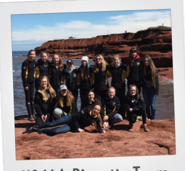
U14AA Ringette Team

How fortunate we are to live in this incredible country filled with natural wonders, vibrant cities and close-knit communities. Our strength is in our diversity; our future is in our big-hearted and peace-loving spirit. So grab that bottle of maple syrup, raise your cup of Tim's, and say it loud and proud: I am Canadian!